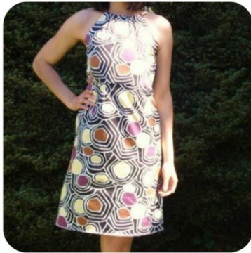
Tricia Dress pattern and tutorial