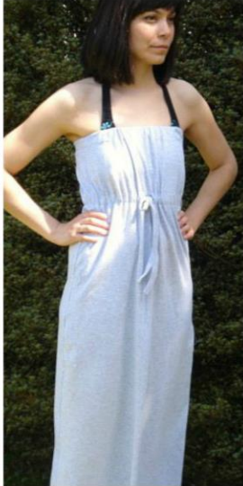
Easy t-shirt Free pattern and tutorial